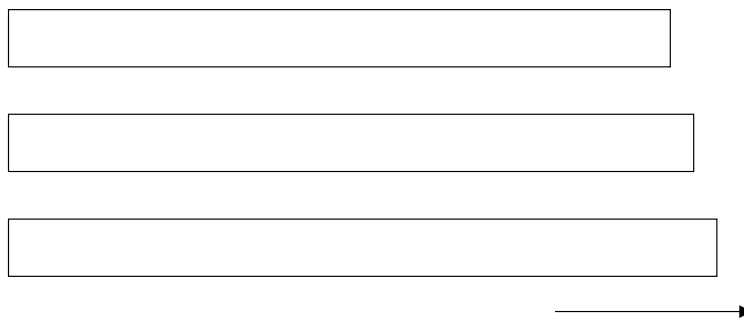
Figure 1: Possible differences in the OFDMA symbol duration

nominal symbol duration of 112.044 \mu\text{sec} maximum symbol duration of 114.285 \mu\text{sec} minimum symbol